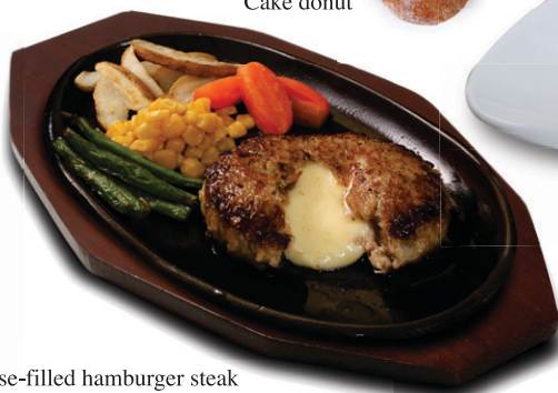
Cheese-filled hamburger steak (with additional forming device)