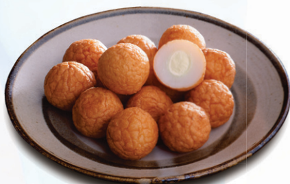
Boiled fish Paste Mayonnaise