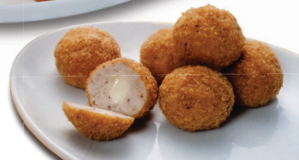
Cheese-filled chicken balls