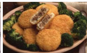
Meat Filled Croquette