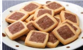
Almond Cookie (with Option)