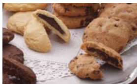
Chocolate Filling Cookie

● Please use KN551 for making various products. (The products below are just few examples among many.)