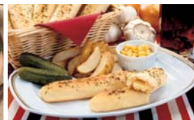
Cheese filled Bread Stick