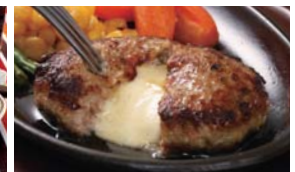
Cheese filled Hamburger