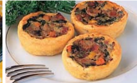
Quiche (with Option)