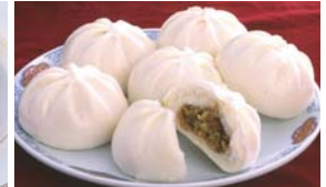
Steamed Chinese Meat Bun (with Option)