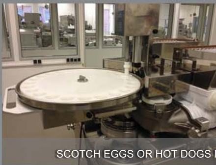
SCOTCH EGGS OR HOT DOGS MADE WITH THE SOLID FEEDER UNIT