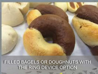
FILLED BAGELS OR DOUGHNUTS WITH THE RING DEVICE OPTION