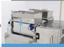
new stainless steel cylinders