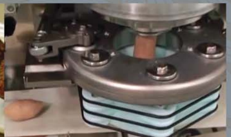
KUBBA OR KIBBEH MADE WITH THE KUBBA SHUTTER