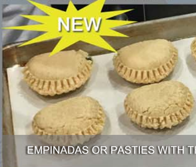
EMPINADAS OR PASTIES WITH THE EMPINADA FORMER