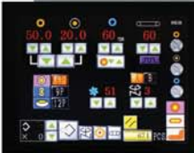
new 'easy to see and use' colour, graphical HMI