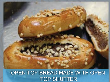
OPEN TOP BREAD MADE WITH OPEN TOP SHUTTER