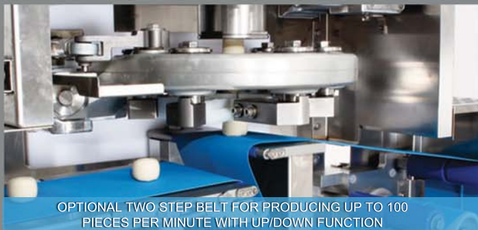
OPTIONAL TWO STEP BELT FOR PRODUCING UP TO 100 PIECES PER MINUTE WITH UP/DOWN FUNCTION